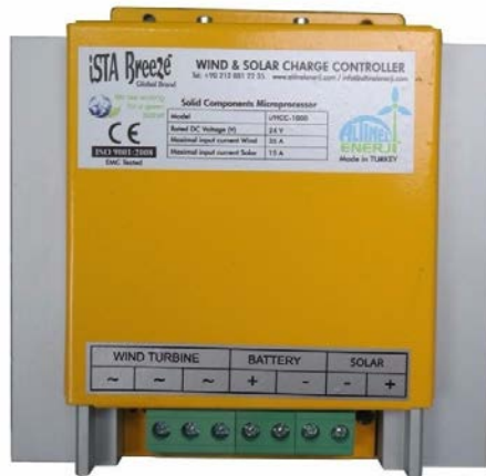
i/HCC-1000- Charge Controller